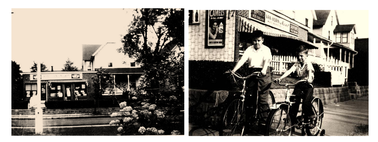
Van Horn Market with Dad in Doorway